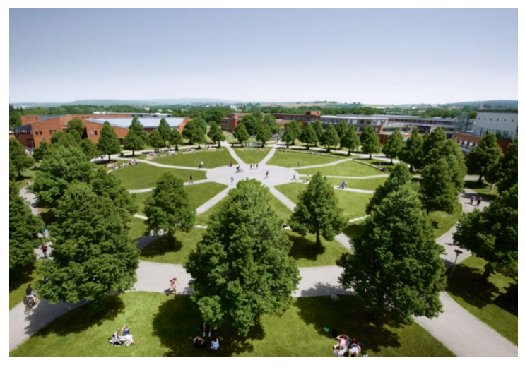
The University of Bayreuth is a pioneer in Germany in the field of sports economics. For over 30 years, the university has been training internationally qualified all-rounders in sports management. The campus has everything you need right at your doorstep, and in contrast to the large universities you'll see familiar faces on almost every corner.