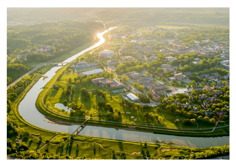
With over 50 years of experience in sports management, Ohio University is the first choice of many in the field. The U.S. News & World Report also gave Ohio University excellent ratings in the categories Business Schools, Education Schools, and National Universities.