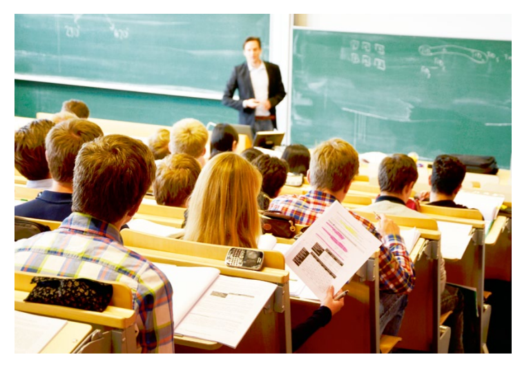
The double degree program is characterized by mutual exchange. While the German students are studying in Ohio, the American students spend two semesters at the University of Bayreuth. The impressive alumni network ensures that everyone stays in touch after graduation.