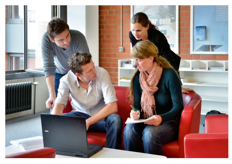
Both universities focus on both sports practice and the demanding disciplines of sports management. These include sports sciences, sports law, and the sport business.